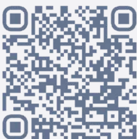
China and Hong Kong Camps